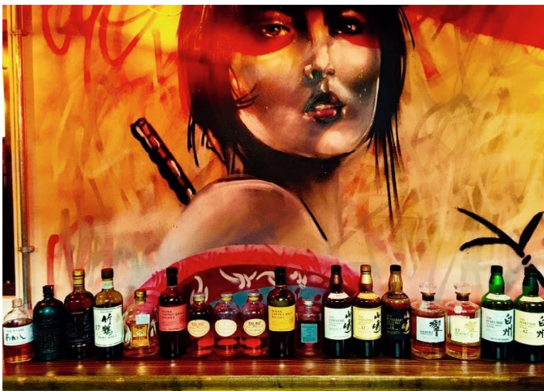
Lost in Tokyo

Lost in Tokyo is an underground Asian Bar, inspired by downtown Tokyo it features leather booths separated by wooden screens, and low hanging lanterns and neon signage. If you like to drink Sake as well as beer, this is the place for you.