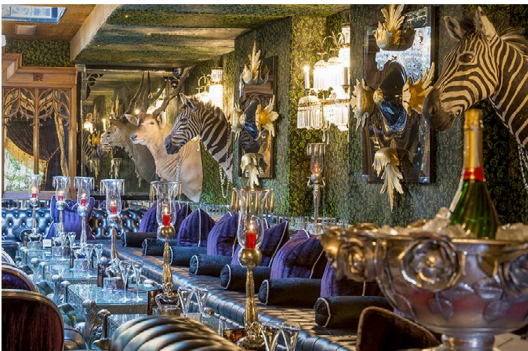
Crazy Bear Group

A converted 15th century coaching inn located in the quintessential English suburb of Beaconsfield is home to the mesmerising and elaborately designed Crazy Bear Bar. It is the definition of opulent with exotic taxidermy wearing crystal necklaces filling the walls, an abundance of chandeliers and velvet wallpaper, a drink here is an entirely unique experience. If you don't live close by fear not, the crazy bear is also a hotel which has equally as eccentric room decor. A definite must stay!